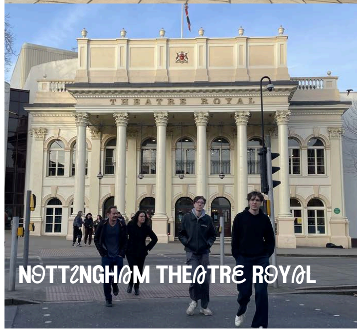
NOTTINGHAM THEATRE ROYAL