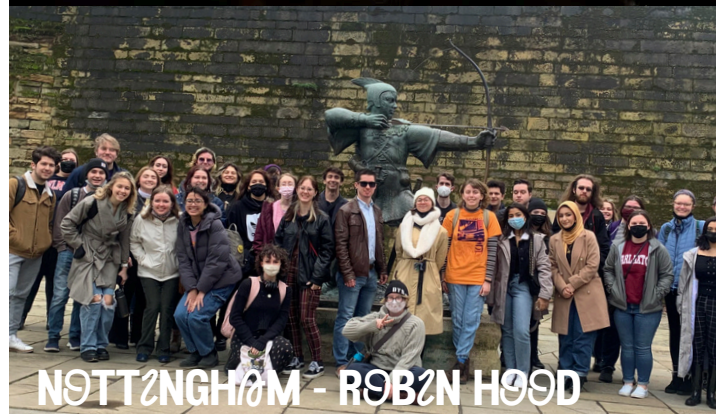
NOTTINGHAM - ROBIN HOOD