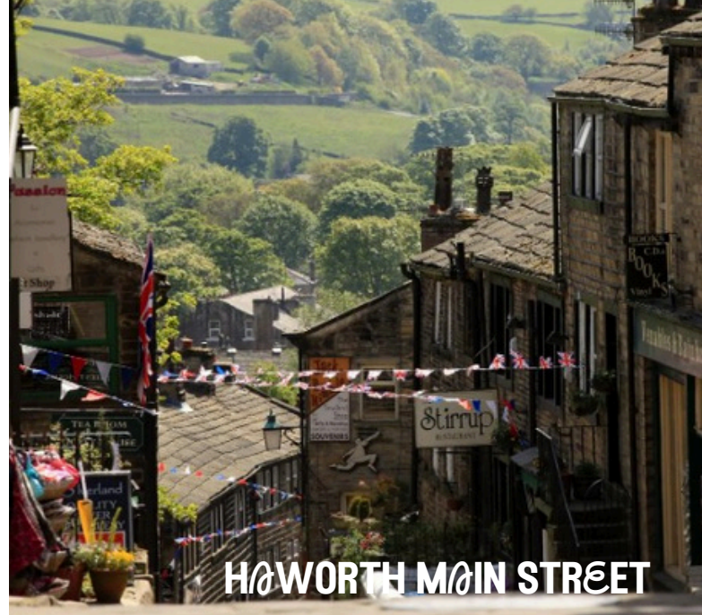
HAWORTH MAIN STREET