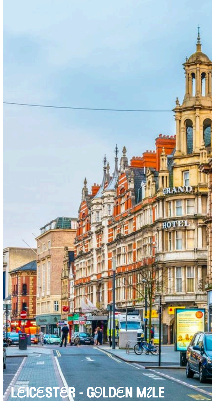
LEICESTER - GOLDEN MILE