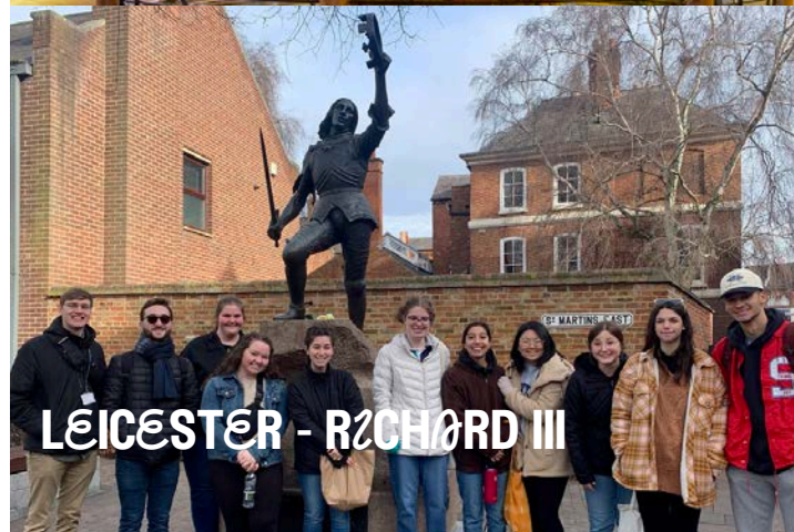
LEICESTER - RICHARD III