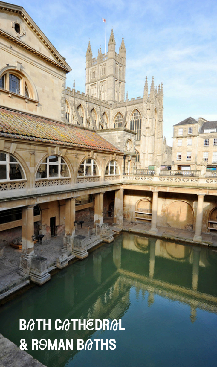
BATH CATHEDRAL & ROMAN BATHS