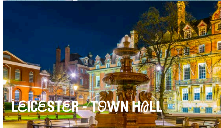
LEICESTER - TOWN HALL