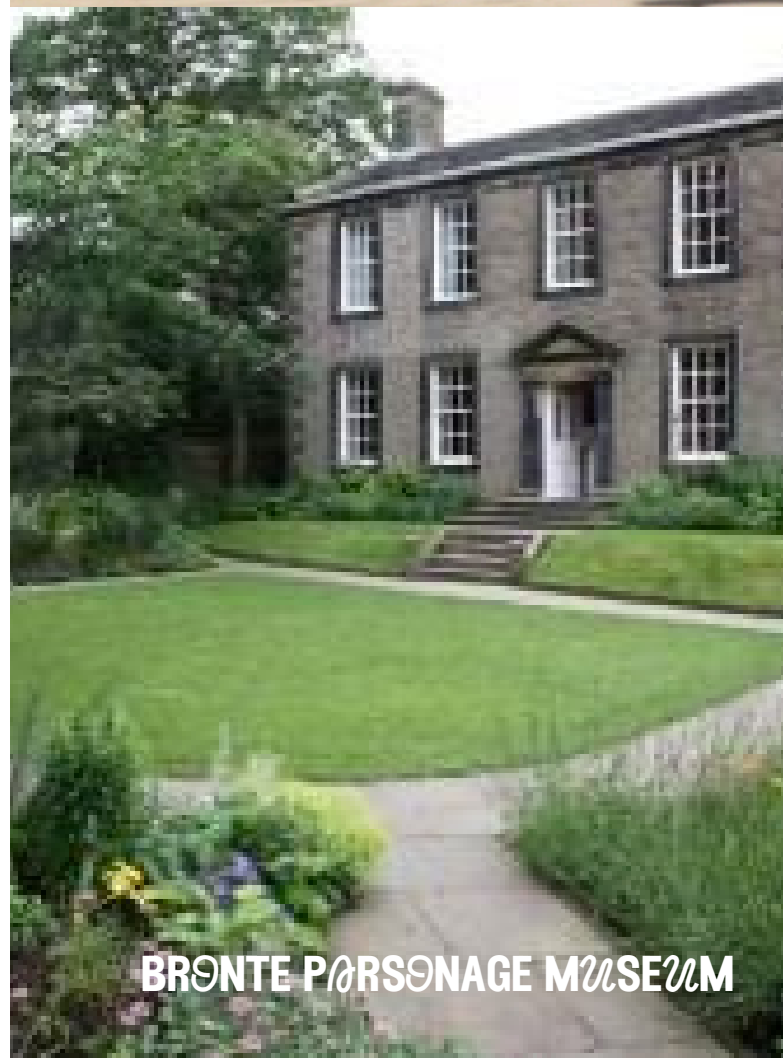
BRONTË PARSONAGE MUSEUM