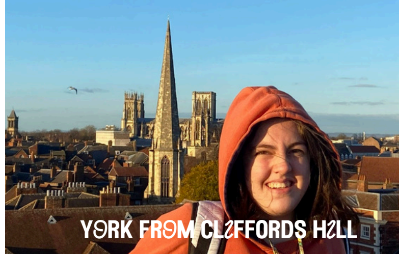
YORK FROM CLIFFORDS HILL

This trip is included as part of the Fall 2025 Family Trip. If your family have signed up you will automatically be added to this trip.