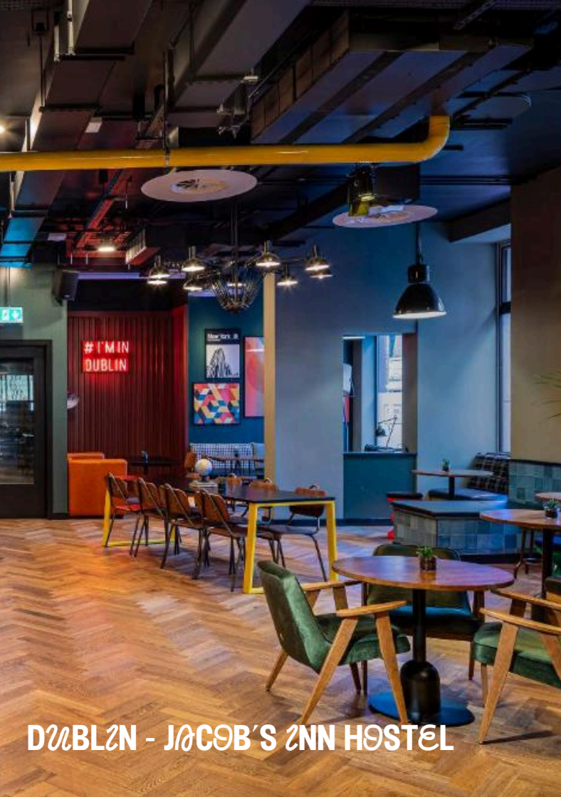
DUBLIN - JACOB'S INN HOSTEL

You will receive a Dublin pass which permits entry to three famous Dublin attractions. This evening you can choose to visit the Guinness Storehouse if you like.