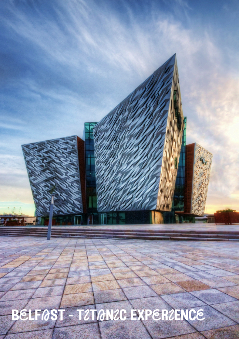
BELFAST - TITANIC EXPERIENCE