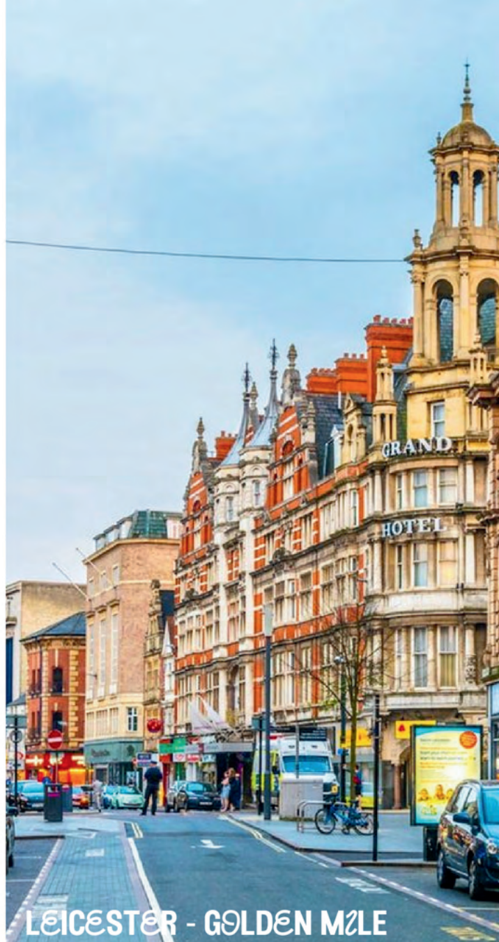
LEICESTER - GOLDEN MILE