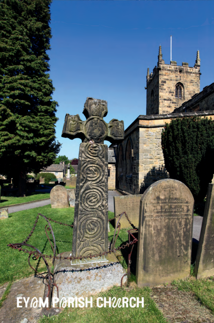
EYAM PARISH CHURCH