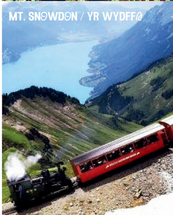
MT. SNOWDON / YR WYDDFA