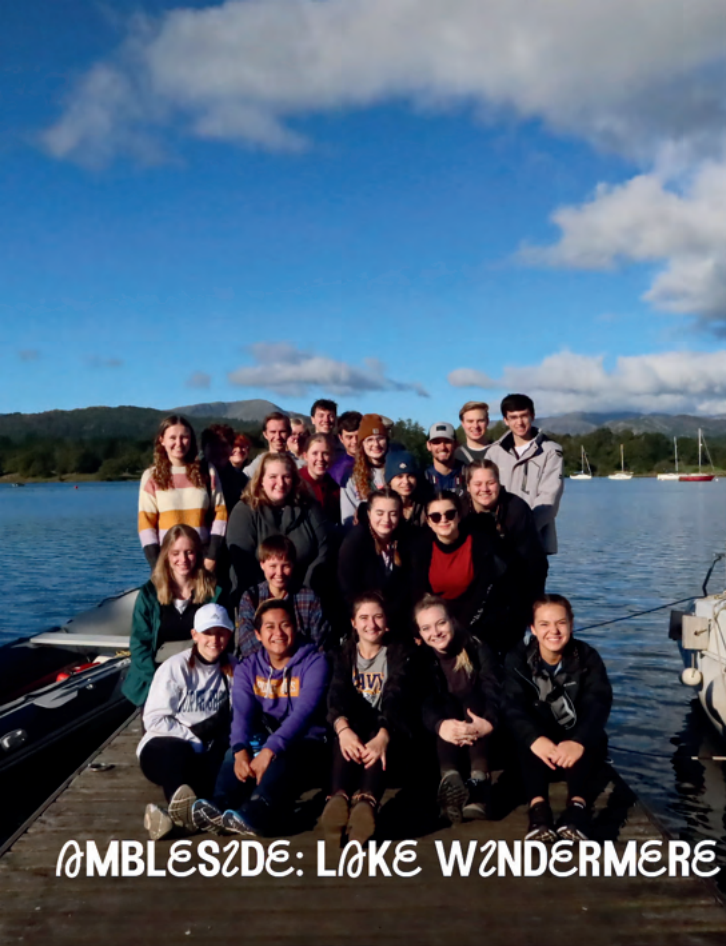
AMBLESIDE: LAKE WINDERMERE