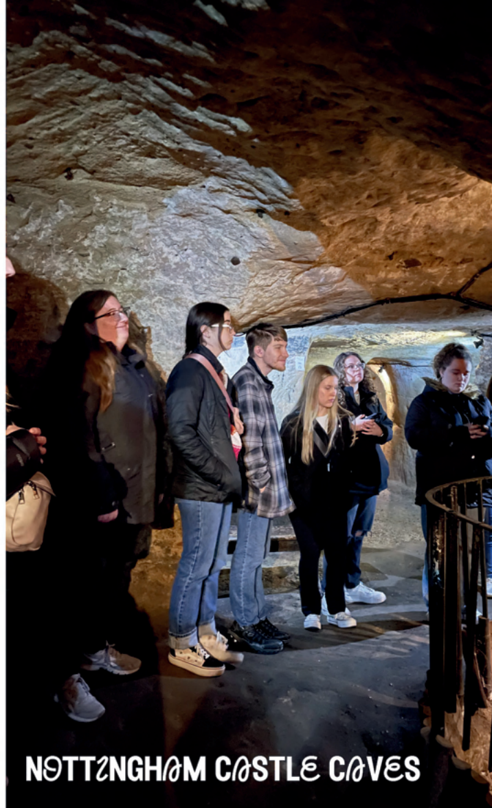
NOTTINGHAM CASTLE CAVES