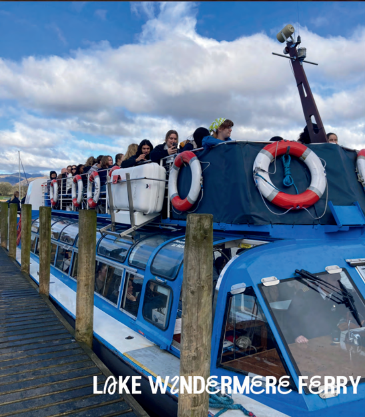
LAKE WINDERMERE FERRY