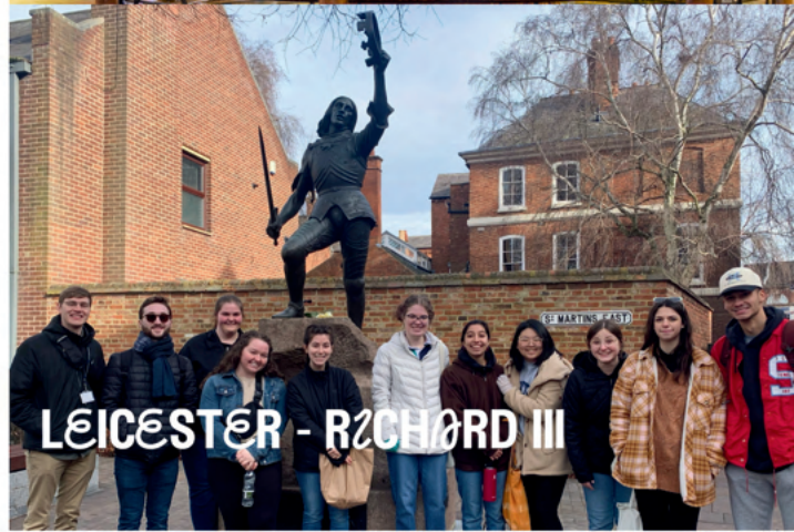
LEICESTER - RICHARD III