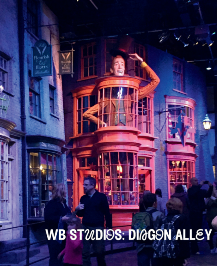
WB STUDIOS: DIAGON ALLEY