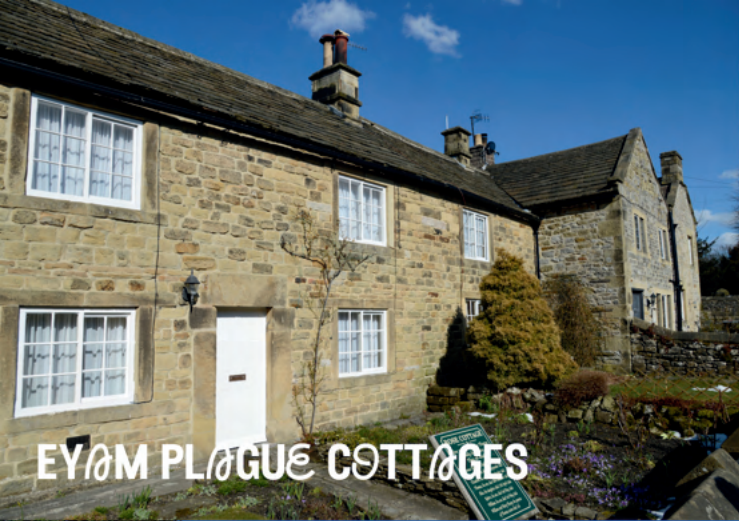
EYAM PLAGUE COTTAGES