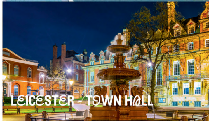
LEICESTER - TOWN HALL