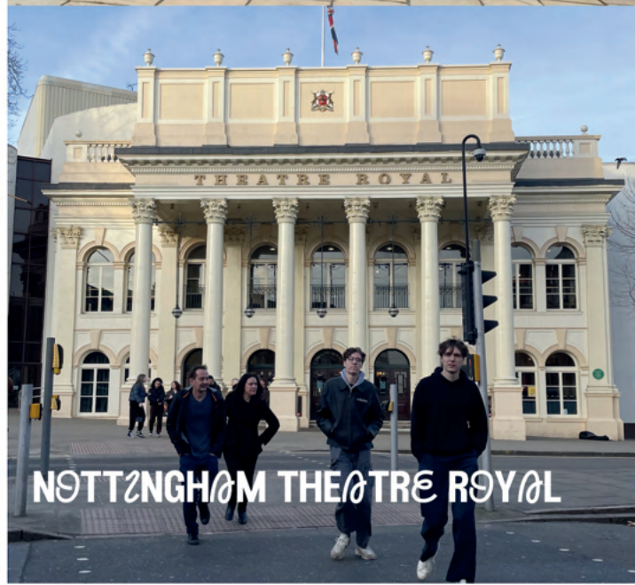
NOTTINGHAM THEATRE ROYAL